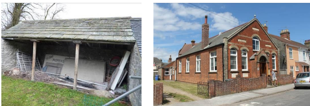
Figure 15: The gig house/cart shed at Monyash, Derbys., left, and the mission hall at Pakefield, Norf.

In addition to the meeting house, Friends sometimes erected other buildings on the same site to meet their practical needs. Where ancillary buildings exist, they are noted in the individual reports. In rural areas the most common additional building were found to be a stable or a gig house, sometimes with a mounting block. There are also a few examples of a privy or earth closet, as at Colthouse, Cumbria. Other ancillary structures include a cottage for the warden (or caretaker) and a schoolroom or adult school, which might be attached or freestanding, contemporary or a later addition. During the late nineteenth century, a number of mission halls were built but few of these appear to survive; a rare example is at Pakefield, Norfolk, of 1897 (figure 15).