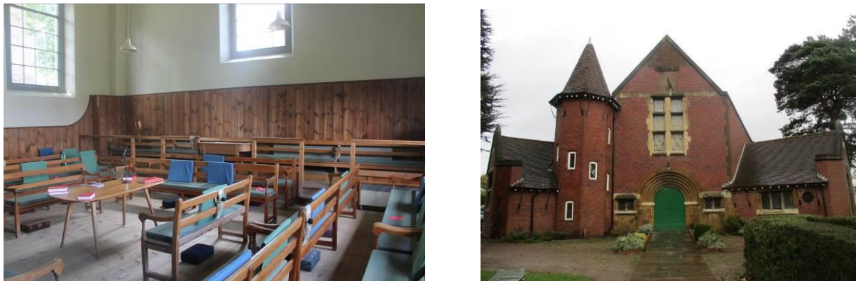
Figure 9: Victorian and Edwardian meeting houses: Street, Som., 1850, by J. Francis Cotterell, left, and Bournville, Warks., 1905, by W.A. Harvey

In the West Midlands, the Cadbury family of chocolate-makers were influential in the adult school movement in the area; they funded the building of many meeting houses and adult schools, including the meeting house at their model village of Bournville (figure 9). The adult school movement was active across the country and prompted new buildings or classroom extensions, as at Settle (North Yorks.) where first an extension to the meeting house and later a separate Adult School building were constructed, both in the nineteenth century. New meeting houses were increasingly built with integral classrooms.