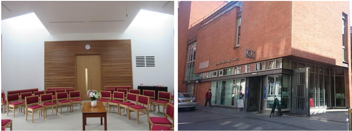
Figure 11: Recent buildings: Kingston, Greater London, 2014 by John Langley of Tectus Architecture, left, and Liverpool, 2006, by Page and Park

favour this solution. Apart from domestic buildings, such conversions utilise a wide range of building types, including former public houses, Brethren halls, church schoolrooms, agricultural and industrial buildings, and even a boat store.