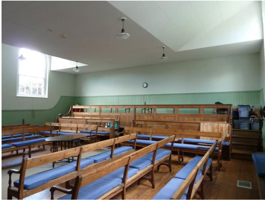
Figure 12: Maldon Meeting House, Essex, 1820-1, with a full set of moveable benches as well as fixed wall-benches and the stand

The earliest loose benches (or ‘forms’) were very simple, and initially may not have had backs or any concession to comfort. Later, back rails were added to some of them (figure 13). By the early nineteenth century, some common patterns of loose bench design were in use; these generally have an open back with horizontal rails, plain legs and simply shaped arm rests (figures 12, 13). Early arm rests are often solid, but more refined examples are open with turned vertical supports to the end of the arm. Late nineteenth and early twentieth-century bench ends are frequently of the inverted Y-type.