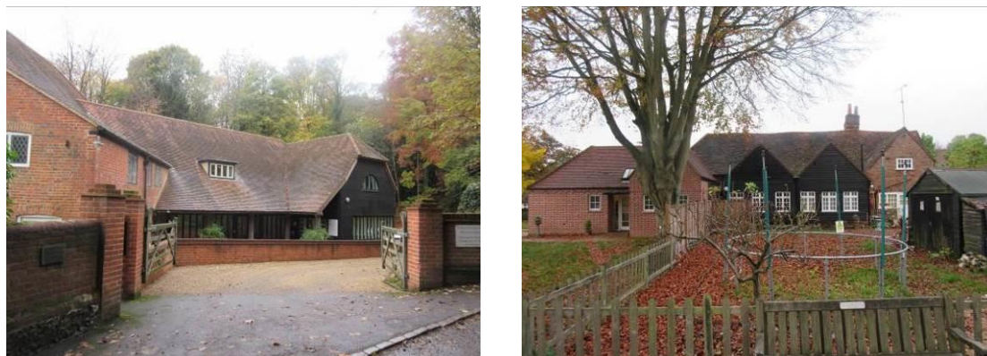
Figure 23: Two successful extensions in a vernacular style: the new wing at Jordans, Bucks., (left) and a new addition at the far left of the meeting house at Amersham, Bucks.

House (Bucks.) as part of the post-fire repairs in 2005-8, to a design by Andrew Townsend Architects (figure 23).