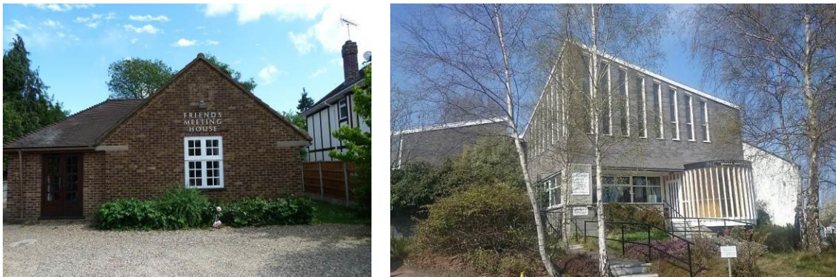
Figure 10: Post-war buildings: Brentwood, Essex, 1957, by Hubert Lidbetter, left, and Heswall, Merseyside, 1963, by Beech and Thomas

Strikingly modern meeting houses include those at Heswall (Merseyside, 1963, by Beech and Thomas, figure 10) and the brutalist building at Blackheath (Greater London, 1972, by Trevor Dannatt). Modernist post-war meeting houses by nationally important architects are relatively rare.