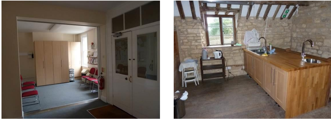
Figure 26: A kitchenette in a cupboard at Southampton, Hants., left, and a sink unit in the gallery at Broad Campden, Glos.

rear of the meeting room, as at Hastings (East Sussex) and Guernsey (Channel Islands). At Southampton (Hants), a small kitchenette hidden in a modern cupboard has been inserted, while at Broad Campden (Glos., Grade II) and at Ashburton (Devon) simple sink units with cupboards have been sufficient for the users of the meeting rooms (figure 26). (Ashburton also has a full kitchen on the floor below.)