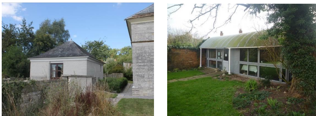
Figure 25: Examples of detached buildings: The detached block of 1985 at Long Sutton, Som., left, and the converted Victorian carriage shed at Brant Broughton, Lincs.

Sometimes, an existing ancillary building can be adapted, obviating the need for an expensive new building and giving an existing one a new function. For example, the former barns at the Come-to-Good Meeting House in Cornwall and the Blue Idol Meeting House in West Sussex are now children's rooms. At Brant Broughton (Lincs.), two outbuildings have been successfully converted: a late eighteenth-century stable building is now used as additional meeting space, and a formerly open corrugated iron carriage shed, now also meeting space, was converted in the 1990s by the county council, with the insertion of a modern timber 'pod' (figure 25). Initially used by the council as a village heritage centre, the building is now managed by the local meeting.