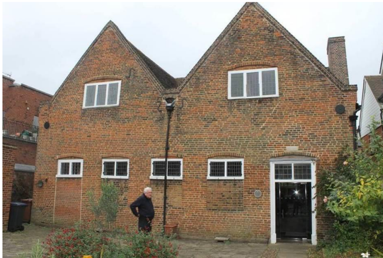
Figure 5: Hertford Meeting House of 1670, the oldest surviving meeting house still in use

Marazion (Cornwall, 1688/89). These early meeting houses were built by local craftsmen using local skills and materials and were on a domestic scale. They frequently resemble vernacular houses built following regional traditions and using local materials. Windows tended to be of horizontal proportions, with casements. Contrasts between early meeting houses in different regions generally reflect local vernacular traditions and building materials, particularly for meeting houses built up to the late eighteenth century.