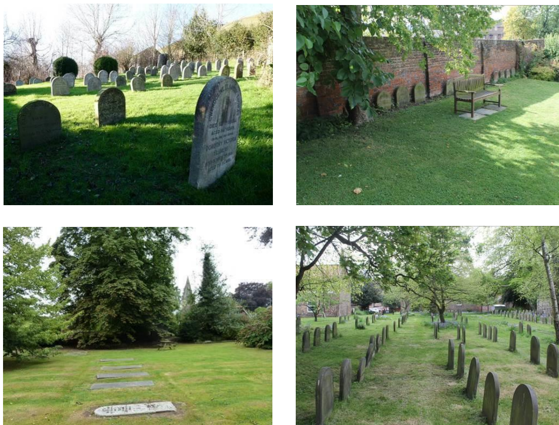
Figure 14: Examples of attached burial grounds (clockwise from top left): Pales (Wales), Hemel Hempstead (Herts.), Darlington (County Durham), Alton (Hants.)

origins. The simple semi-circular or segmental-headed stones are a distinctive feature of Quaker burial grounds. There are a few regional variations in shape, material and style, and some have a simple moulded detail to the arched head.