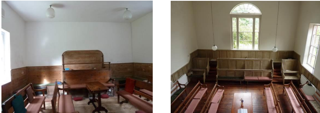
Figure 8: Georgian interiors: Wallingford, Oxon., 1724 (left), and Warrington, Merseyside, 1830

and was usually made of pine or deal and usually left unpainted for simplicity, although oak joinery is found in early eighteenth-century meeting houses.