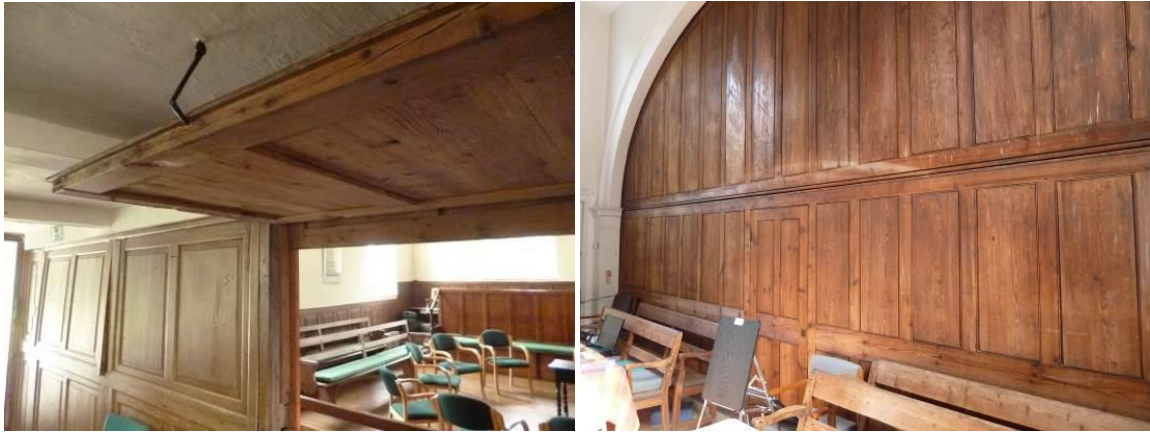
Figure 3: The hinged shutters at Colthouse, Cumbria, 1688-9 (left), and the counter-balanced screen at Dorking, Surrey, 1846 (right)

The stand fell out of use in the twentieth century, as by then Quakers preferred to be seated together on the same level. However, historic stands survive in many older meeting houses (figure 4). Along with the moveable shutters and sliding screens, the stand and its fittings were designed and constructed by skilled local craftsmen and the resulting joinery often includes distinctive examples of historic carpentry. The stand usually incorporates fitted benches along the back wall, with straight backs that are often integrated into dado panelling which is ramped up to the back wall and alongside the steps. There are usually two tiers of fixed benches with a free-standing rail to the front where ministers stood to speak. Some stands have a small hinged table or flap fitted to the back of a bench, as a writing desk for the clerk, and there are also examples of small wall cupboards used to hold books or perhaps candlesticks or a lamp. The rail at the front of the stand, along with the balustrade to the front of the gallery, is sometimes the only example of enriched joinery; most have turned balusters and a moulded handrail. The style of the balustrades and wall panelling can be a useful clue to dating, as the joinery follows regional and national trends in detail and form; this often shows that internal joinery is of more than one phase or that old joinery was retained or re-used when a meeting house was rebuilt.