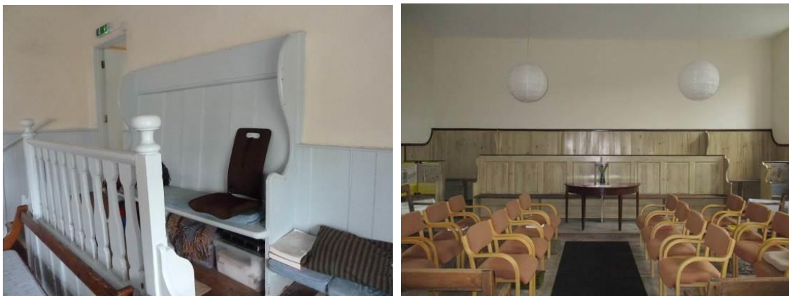
Figure 4: Examples of stands: Marazion, Cornwall, 1688/89 (left), and Gildersome, West Yorks., 1756

The stand fell out of use in the twentieth century, as by then Quakers preferred to be seated together on the same level. However, historic stands survive in many older meeting houses (figure 4). Along with the moveable shutters and sliding screens, the stand and its fittings were designed and constructed by skilled local craftsmen and the resulting joinery often includes distinctive examples of historic carpentry. The stand usually incorporates fitted benches along the back wall, with straight backs that are often integrated into dado panelling which is ramped up to the back wall and alongside the steps. There are usually two tiers of fixed benches with a free-standing rail to the front where ministers stood to speak. Some stands have a small hinged table or flap fitted to the back of a bench, as a writing desk for the clerk, and there are also examples of small wall cupboards used to hold books or perhaps candlesticks or a lamp. The rail at the front of the stand, along with the balustrade to the front of the gallery, is sometimes the only example of enriched joinery; most have turned balusters and a moulded handrail. The style of the balustrades and wall panelling can be a useful clue to dating, as the joinery follows regional and national trends in detail and form; this often shows that internal joinery is of more than one phase or that old joinery was retained or re-used when a meeting house was rebuilt.