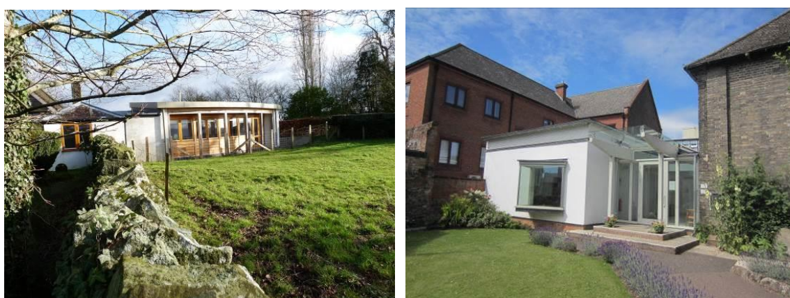
Figure 24: Two additions in a modern style: Recent extension at Almeley Wootton, Herefordshire, left, and the extension at Bury St Edmunds, Suffolk, right

Another strikingly modern addition to a historic meeting house is at Bury St Edmunds (Suffolk), added in 2007-8 to replace a garden room of 1982 (figure 24). Housing a wide glazed entrance corridor/link, garden room, kitchen and WCs, it was designed by Modece Architects of Bury St Edmunds.