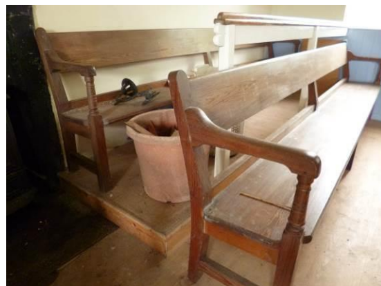
Figure 13: Converted forms at Come-to-Good, Cornwall, left, and typical early nineteenth-century benches at Pardshaw, Cumbria

Small oak tables with turned legs are sometimes seen in meeting houses, which are now placed at the centre of a circle of chairs. The origins of these tables are hard to assess; many may have been made for domestic use. Other potentially early furnishings might include