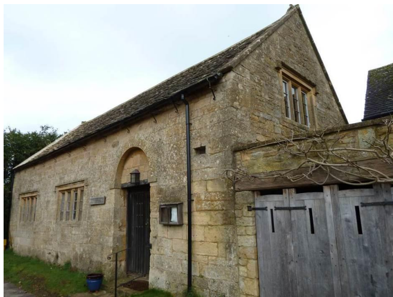
Figure 6: An early conversion of an older building: Broad Campden, Glos., converted to Quaker use in 1663

A number of older buildings were converted to Quaker use in the seventeenth century. Surviving examples include Broad Campden (Glos., possibly a Tudor cottage, converted in 1663, figure 6), Cirencester (Glos., built or converted in 1673), St Helen's (Merseyside, a Tudor house, converted in 1679), Swarthmoor (Cumbria, a barn and a cottage, given by George Fox in 1688) and the Blue Idol (West Sussex, a farmhouse, converted in the 1690s).