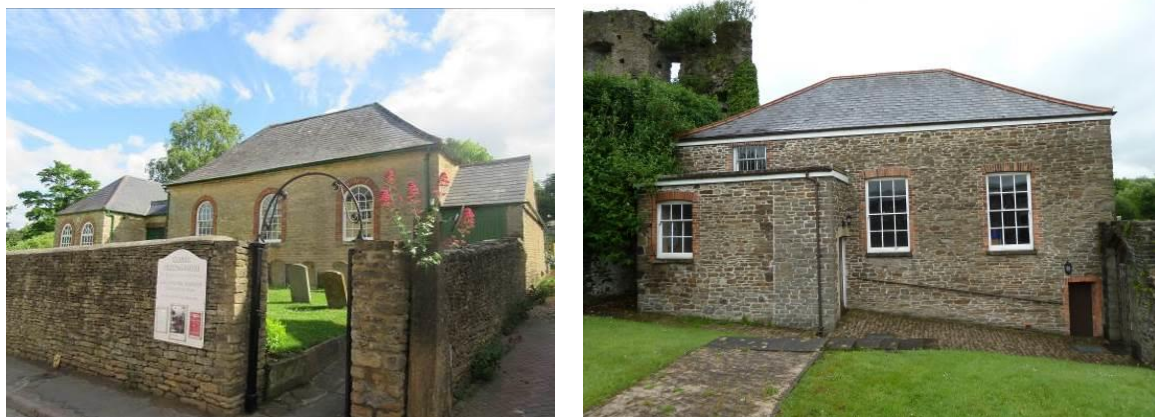
Figure 7: Examples of Georgian meeting houses: Charlbury, Oxon., 1779 (left), and Neath, Wales, 1799-1800

Meeting houses in large urban centres tended to be architecturally more ambitious. Notable examples include the former Quakers’ Friars Meeting House in Bristol (1747-9), Upper Goat Lane in Norwich (1820s) and Mount Street Meeting House in Manchester (1831), the latter designed in Greek Revival style. But most Georgian buildings were smaller and less elaborate, typically simple rectangular structures often with hipped roofs and vertically-proportioned sash or casement windows (figure 7). Depending on locally available materials they might be built of brick or stone. There are examples of earlier buildings being improved in this period, with sash windows being installed in place of casements, as at Swarthmoor and Colthouse (both in Cumbria).