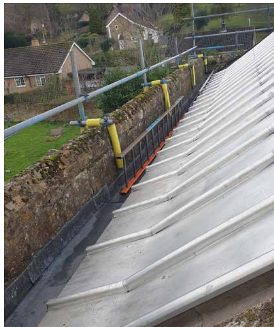
Photo: TCSS roof covering with round batten rolls and lead gutters, upstands and flashings © Jo Hibbert