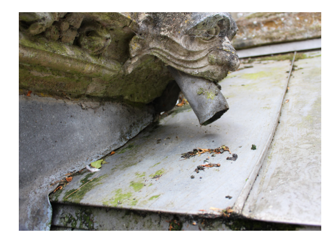
Figure 3: Awkward detail at verge with water running into upstand

Suggest adopt standard traditional details, using lead in small quantities as appropriate.