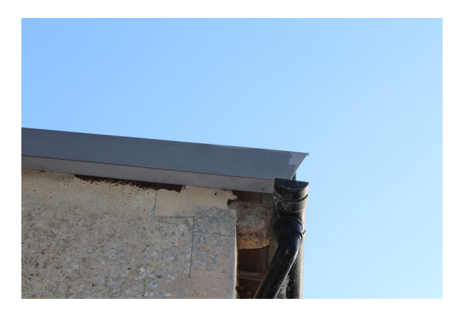
Figure 8: End of fascia with acute corner and incomplete closure