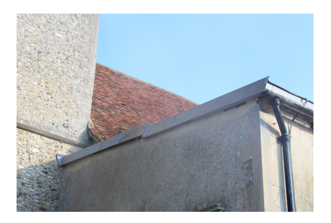
Figure 7: Straight verge fascia contrasts with uneven masonry

Suggest adopt standard traditional details, using lead in small quantities as appropriate.