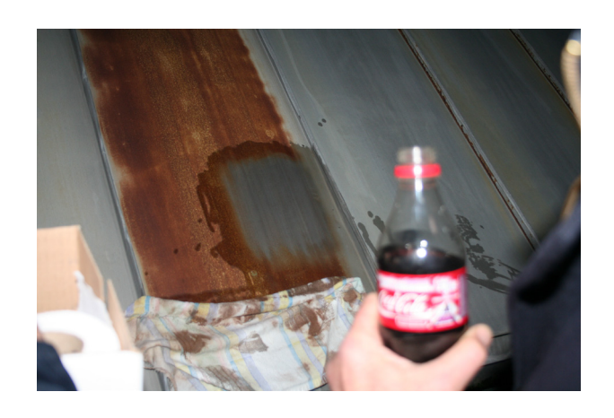
Figure 10: Stain successfully removed using weak phosphoric acid solution