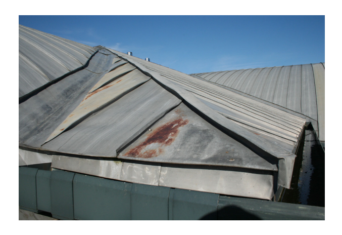
Figure 9: Discolouration of lead-rich terne-coated stainless steel

If discolouration appears, wash down with recommended cleaning solution.