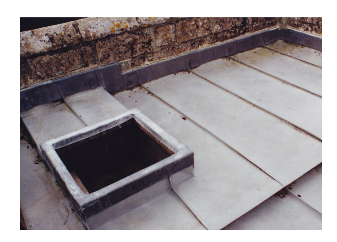
Figure 4: Lead used for flashings and access hatch capping