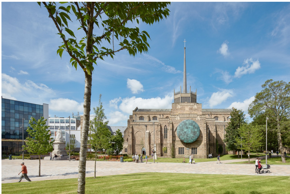
Blackburn's Cathedral Quarter – the new heart of the city

In addition to looking at ways of generating new business and income streams, staff at cathedrals across England have recognised that they contribute millions to the local economy each year. It was estimated in 2014 by the Association of English Cathedrals that cathedrals bring in around £220 million in local spending per year and create over 5,500 local jobs.