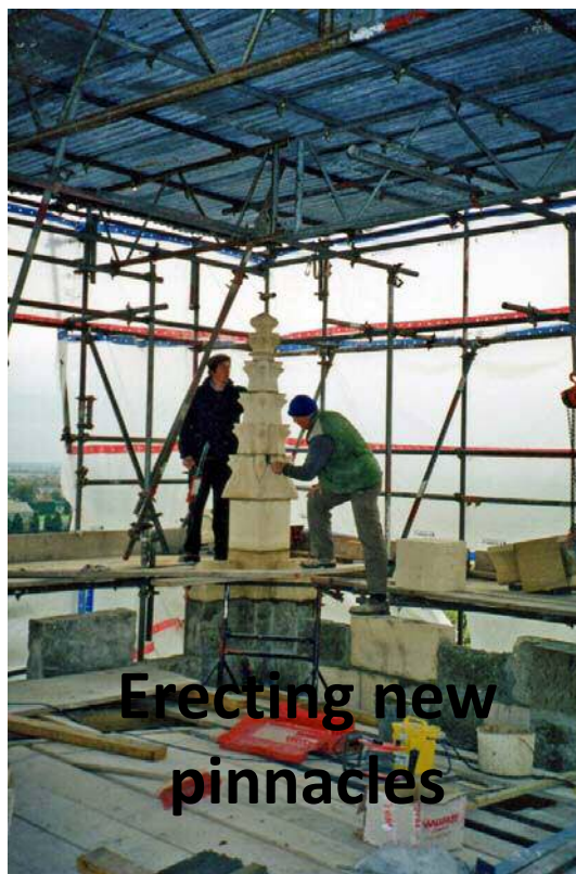
Erecting new pinnacles