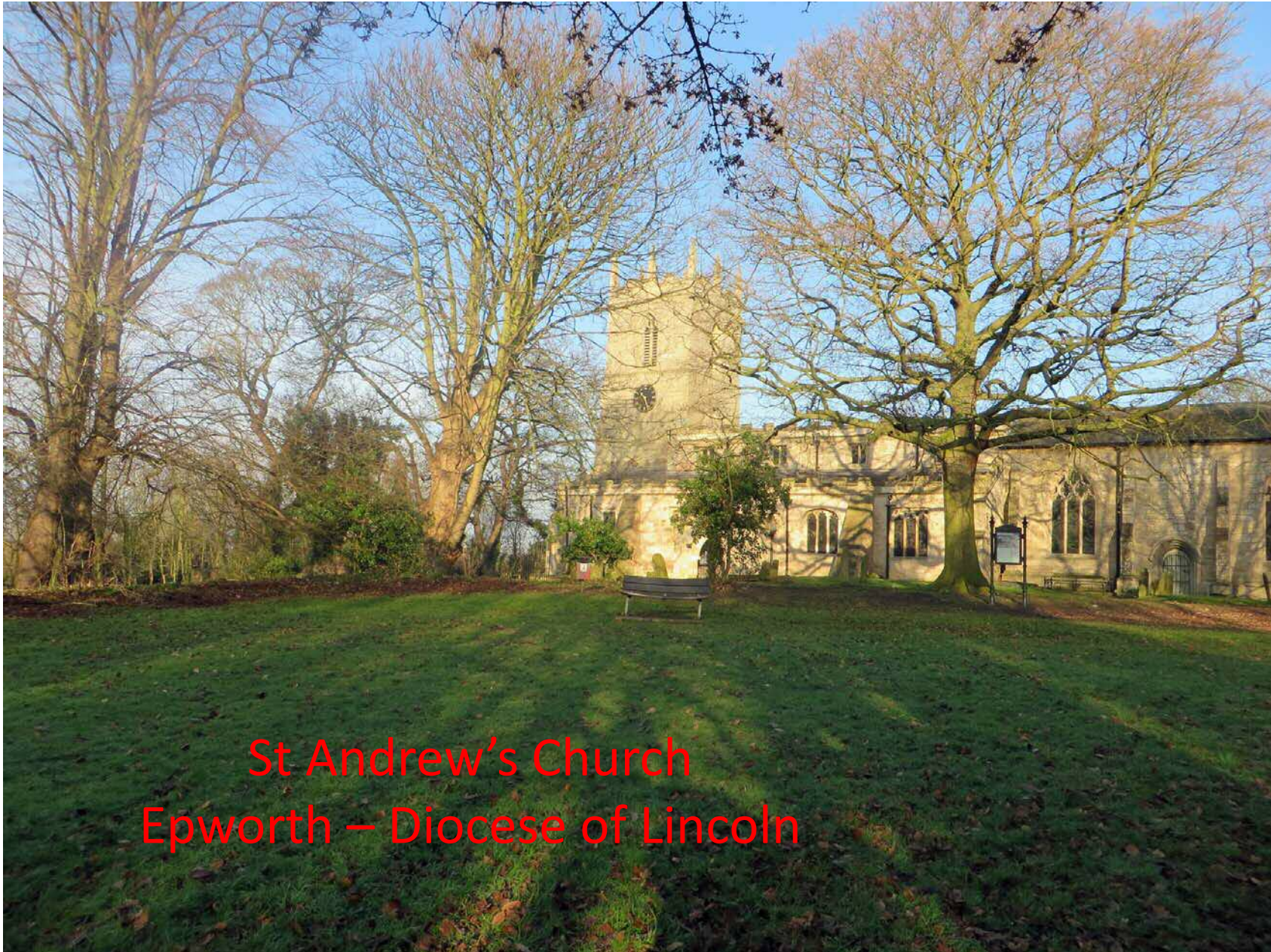
St Andrew's Church Epworth – Diocese of Lincoln