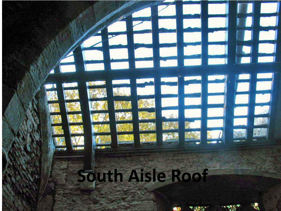
South Aisle Roof