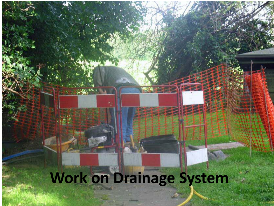
Work on Drainage System