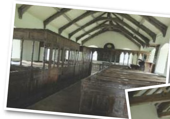
St Ninian's Nine Kirks

Appendix III contains some specific suggestions (arising from the Survey, and from the Churches Trust for Cumbria's own experience) which Churches Trust for Cumbria needs to pursue, and in order to do this, it needs to seek further funds. It can then work in partnership with architects, contractors, grant making bodies, amenity groups, county-level church structures and individual churches, to help the wonderful asset of our church buildings sustainable far into the future.