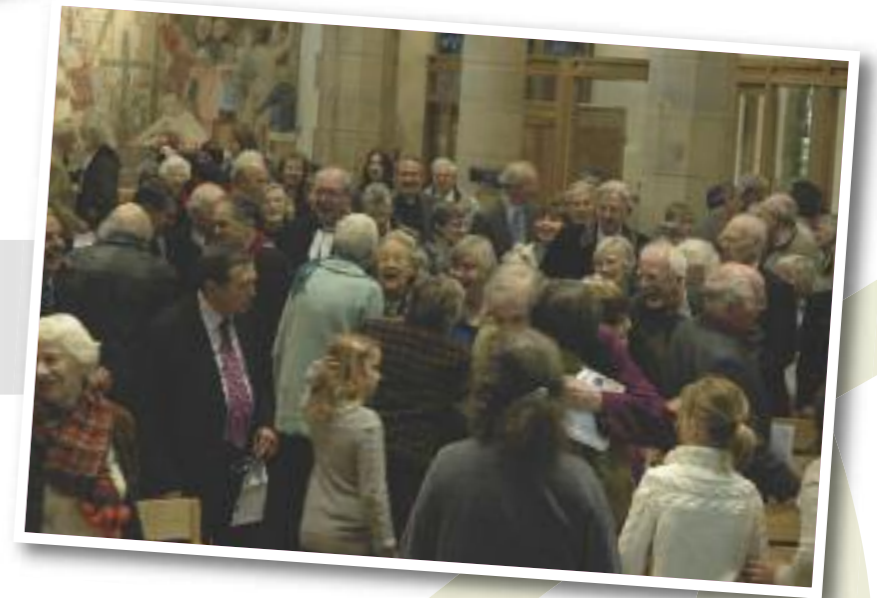
The signing of the Ecumenical Declaration of Intent