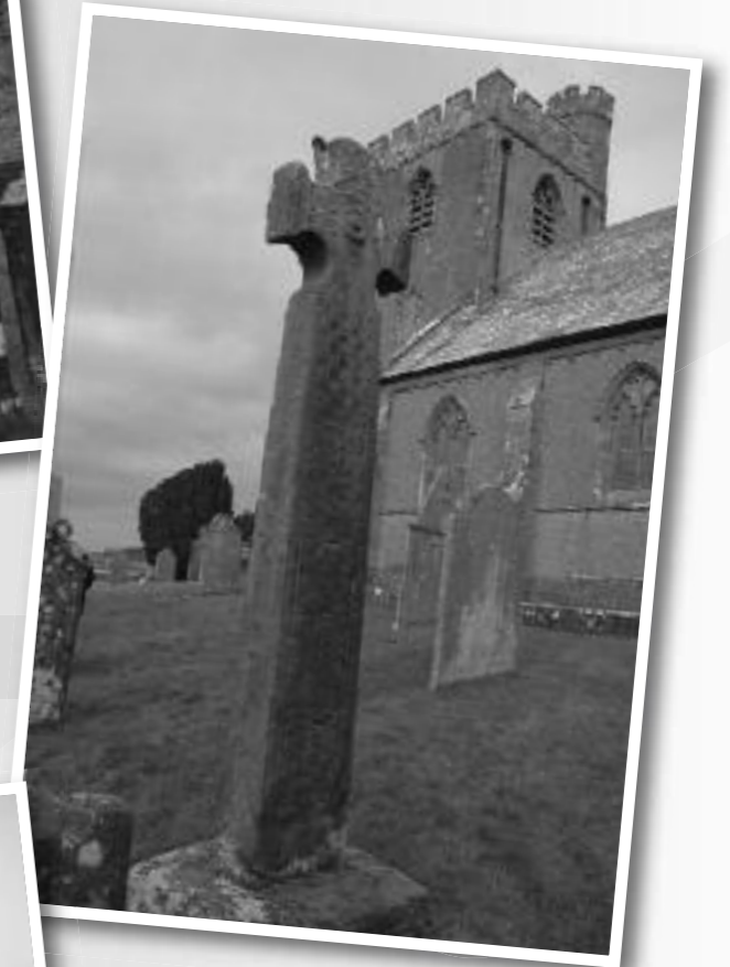
Viking Cross Irton