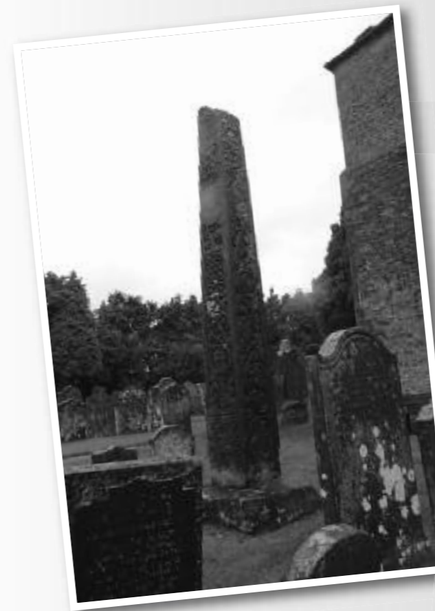
Viking Cross Bewcastle

Mission Communities (the new low-level Church structures – sustainable clusters of churches from all three denominations, working together to combat isolation, to create critical mass, and to focus on outreach and new approaches to worship) will be able to draw upon this data to ensure that wise and informed decisions are made. This includes both how to encourage a wider audience to appreciate the very real value of church buildings to their community as places of history and beauty, as well as their fundamental purpose as places of worship and of glory to God, and also how best to ensure that as many as possible of these buildings are handed down in a sustainable condition to future generations.