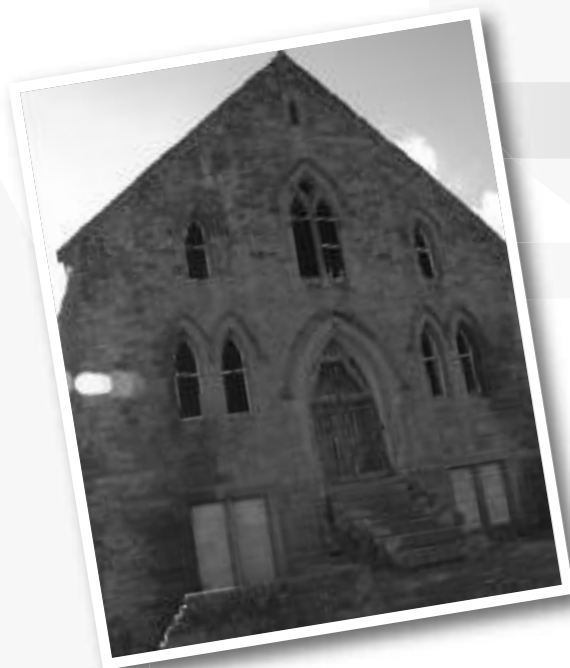
Methodist Church, Cleator Moore

Churches which are open only once a week or less, and are only open for worship, appear to have most problems. The Survey shows that a worryingly large number of churches in Cumbria are in this situation. The county is full of churches with a significant architectural, historic or cultural offering. Too many of these are locked, or if open, the welcome and care of visitors fails to engage effectively, or signpost connected churches. Even churches with a footfall of thousands seem to attract tiny sums from visitor donations.