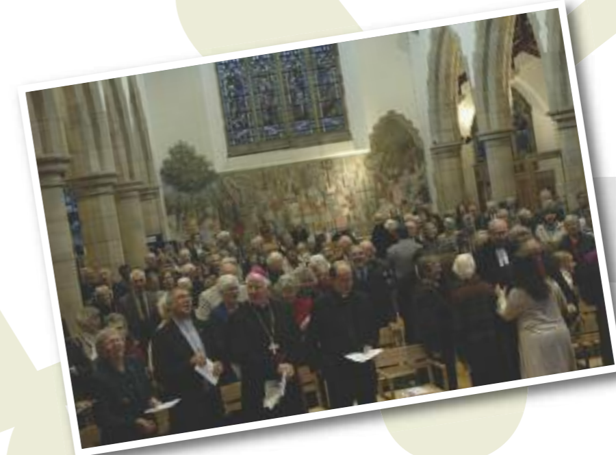
The signing of the Ecumenical Declaration of Intent