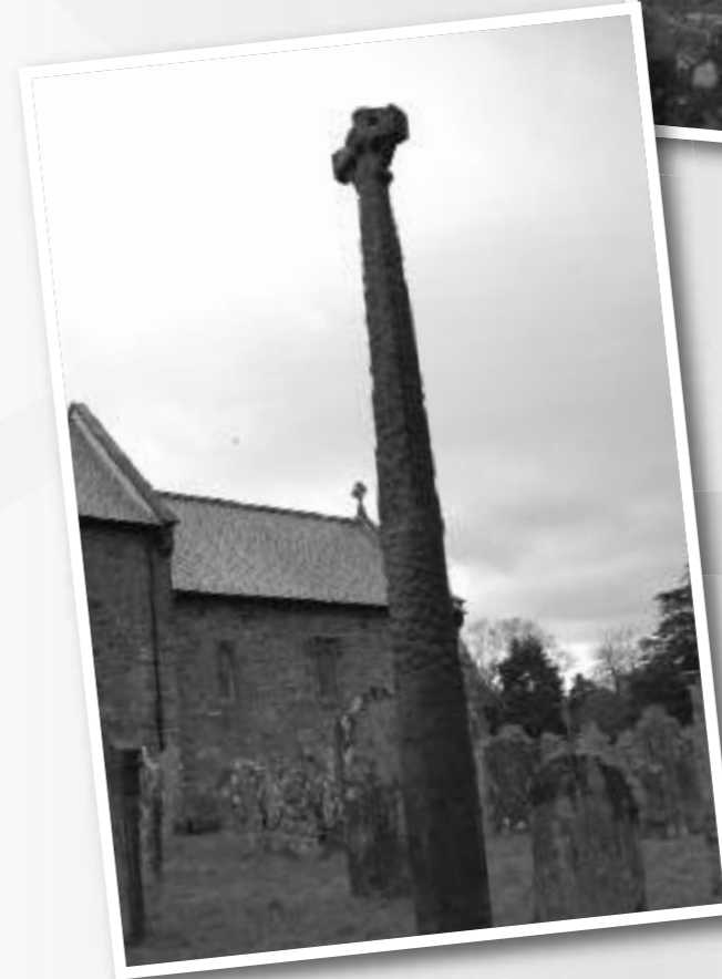
Viking Cross Gosforth