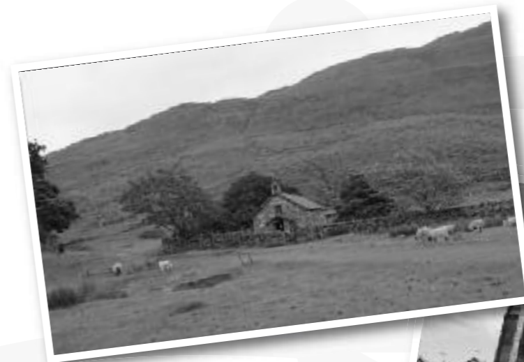
Old St Martins, Martindale