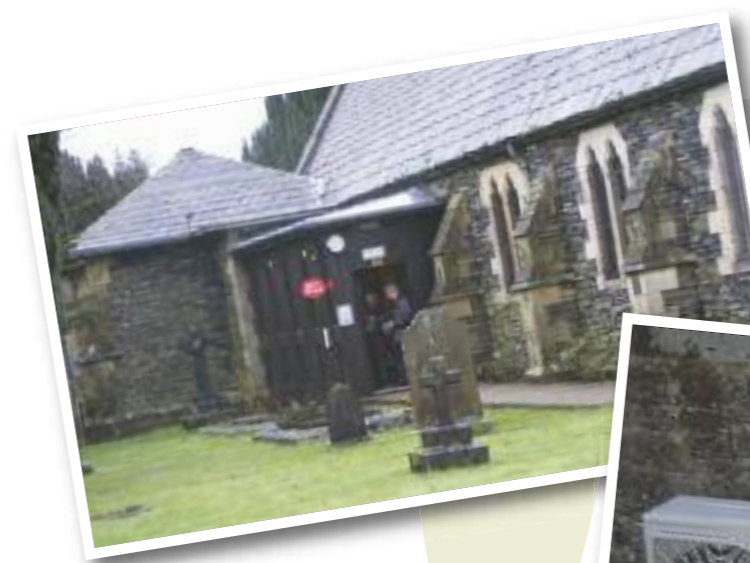
Post Office in Stavley Church

In general, Church congregations are persevering in their church building despite poor and/or expensive heating, notwithstanding a warm Hall nearby. Rising energy costs, specifically for heating, at the time of the Survey, appear to have been the catalyst for many church communities to review patterns and place of worship, and in some cases more broadly to review their overall future.