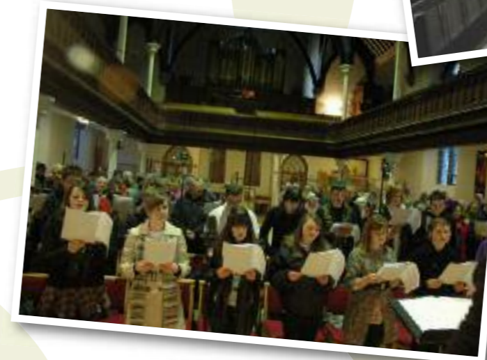
Christ Church Cockermouth (Just after the 2009 Floods)