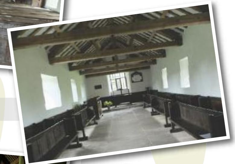
Old St Martin's Martindale