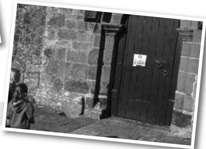
Abbeytown (just after the fire)