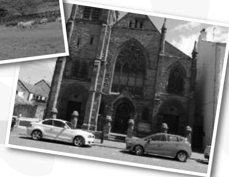
Whitehaven, URC Church