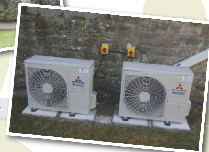
Air Source Heat Pumps at Mosser