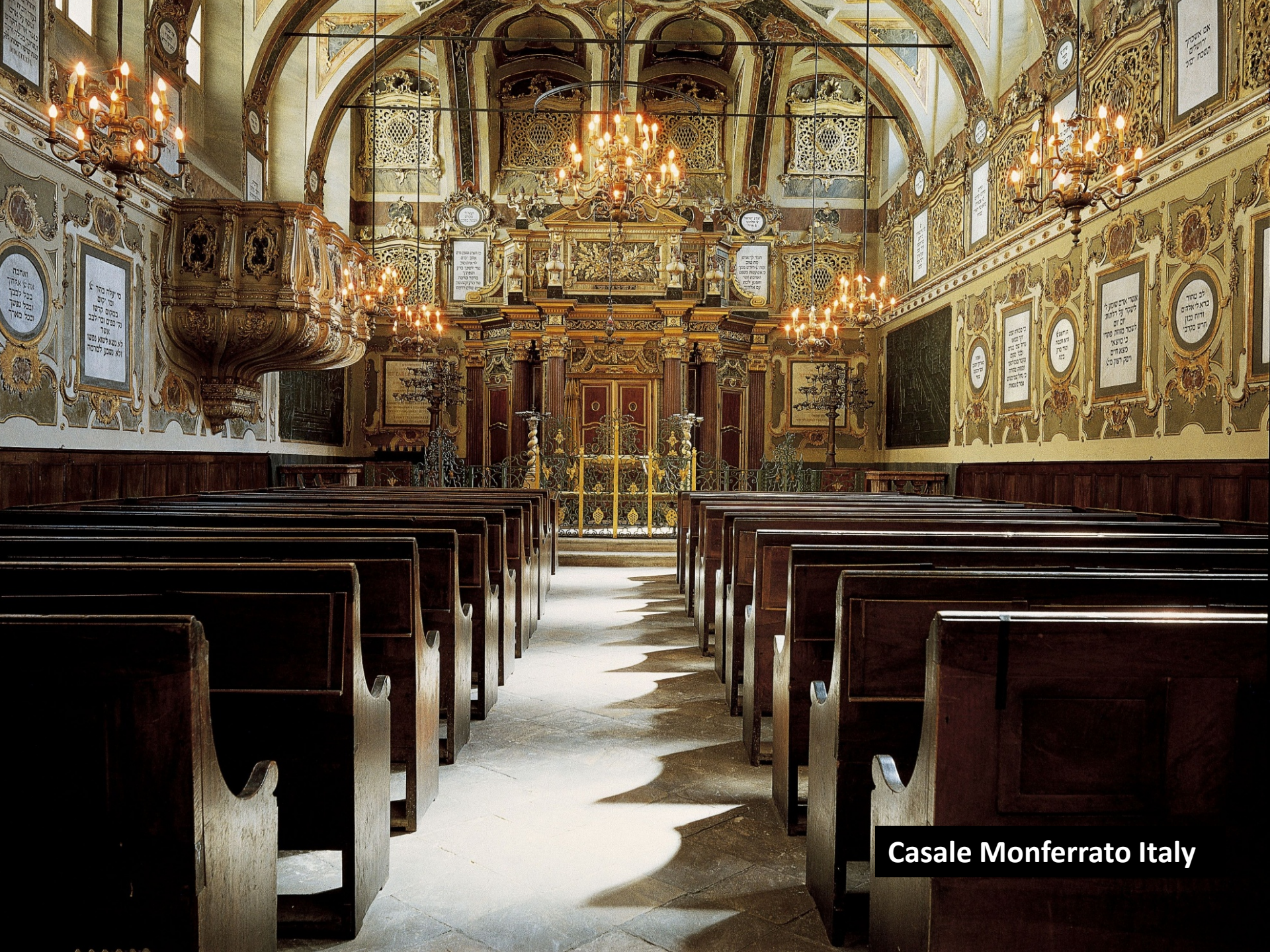
Casale Monferrato Italy